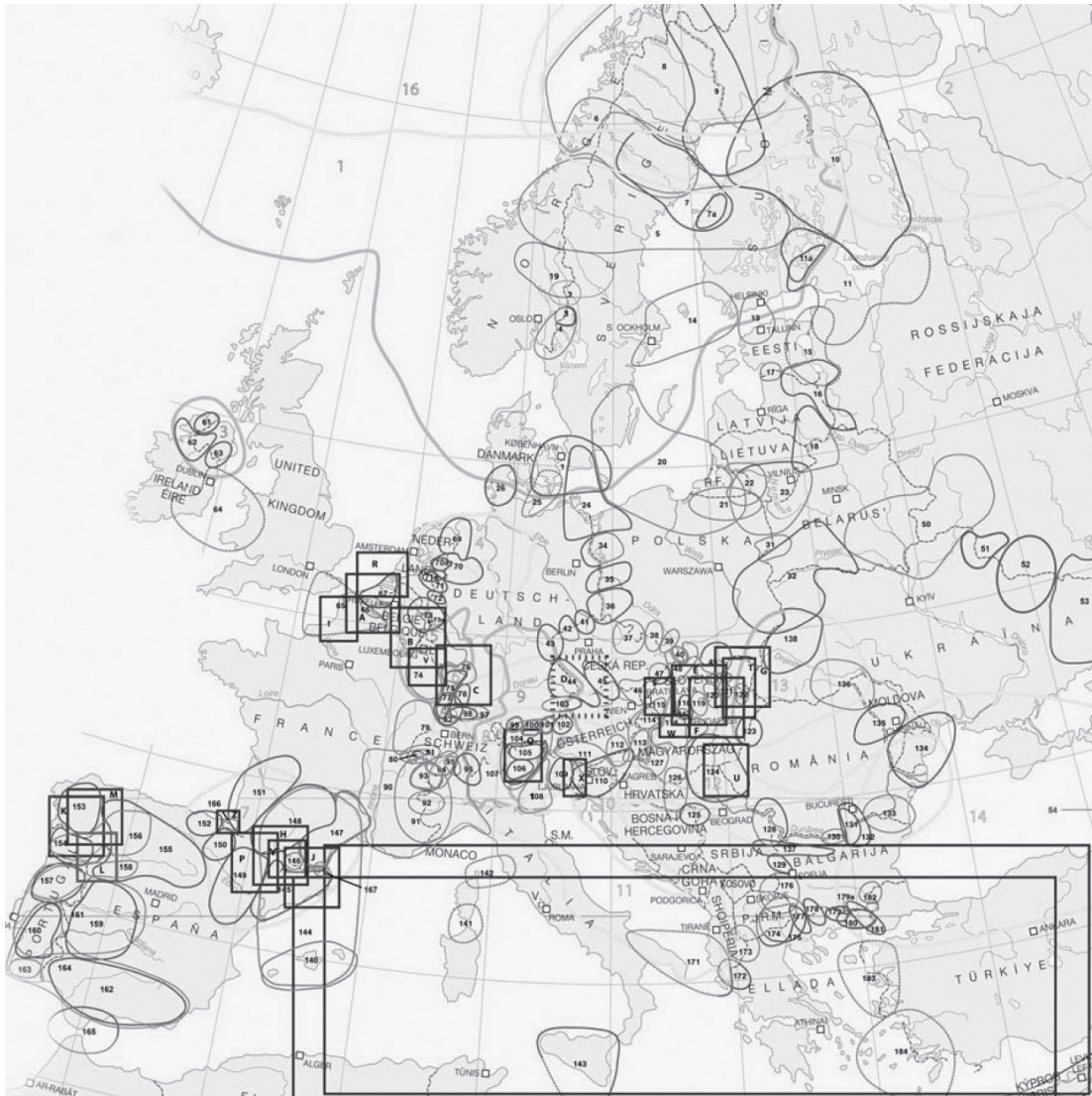
Figure 1: Cross-border cooperation in Europe